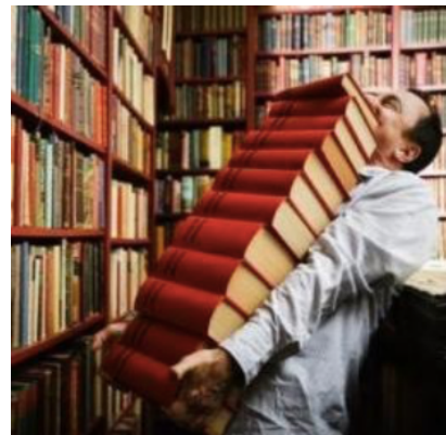
Figure 1: Image used for the Picture condition

The study was designed and hosted on Qualtrics 2 , accessible via a personalised link. The study consisted of a welcome message outlining the exclusion criteria and instructions, as well as a mandatory tick box for consenting to take part in the study. The following page randomly presented the participant with one of the 8 conditions for creating a password. Then, participants were taken to a demographics questionnaire where they were asked to fill standard information such as country of residence, year of birth, gender, and education details. Finally, participants were asked to re-enter the password they created during the first step. The time spent on each page, as well as the number of clicks and the timing of the clicks was recorded by the platform.