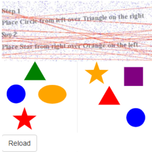
Figure 3: TAPCHA Multi demonstration