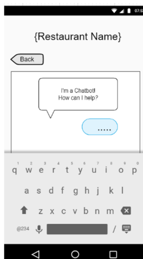
Figure 2: Chatbot functionality to create reservations, add reviews and a Q&A support for the user.

We envisioned and designed early mock-ups of a system where people with food allergies would be able to search for allergy-safe restaurants, cafes and other related food places. Users would start by entering their list of their own allergens (see Figure 1a). Then, users could select their location (see Figure 1b) and get access to a list of places where to eat around them including their customer reviews (see Figure 1c and 1d), based on parameters relevant for people with food allergies.